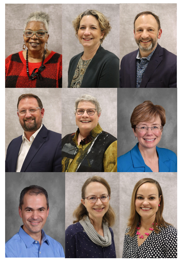
Thank you for your dedicated service!